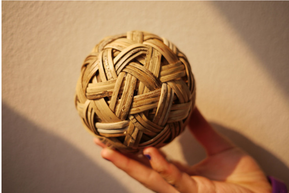
▲ Myanmar Chinlone