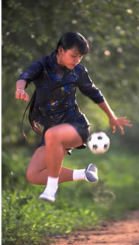
▲ Female solo playing style of Myanmar Chinlone