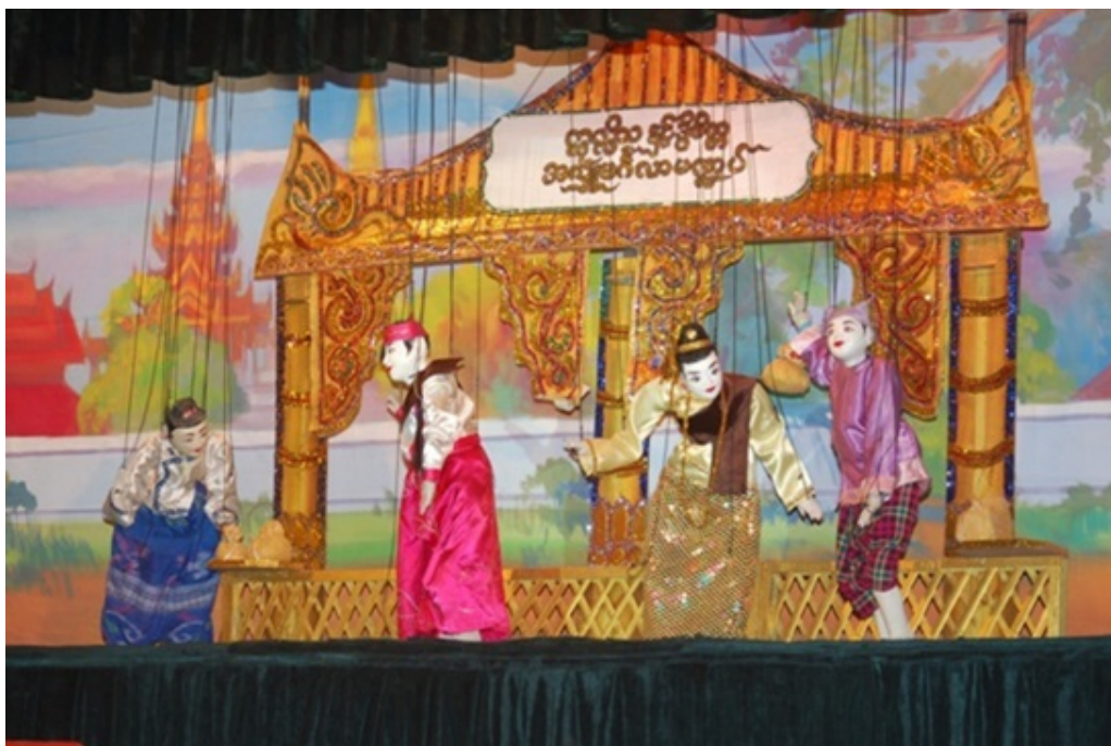
▲ Myanmar Marionette (Grand Drama) Contest