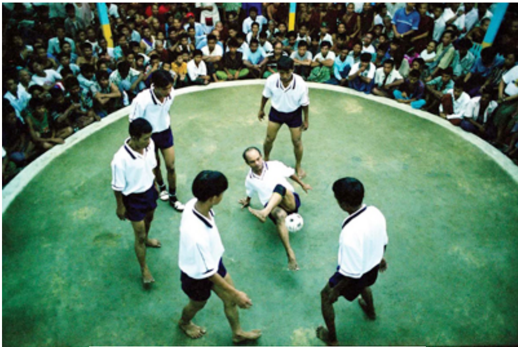
▲ Playing Wein Khat