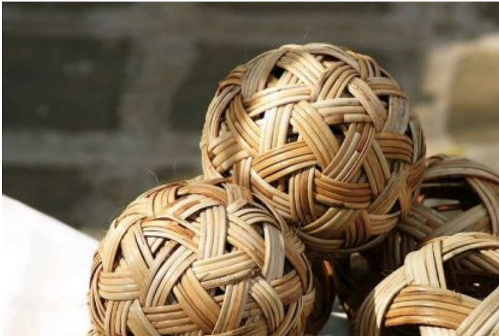
▲ Myanmar Chinlone