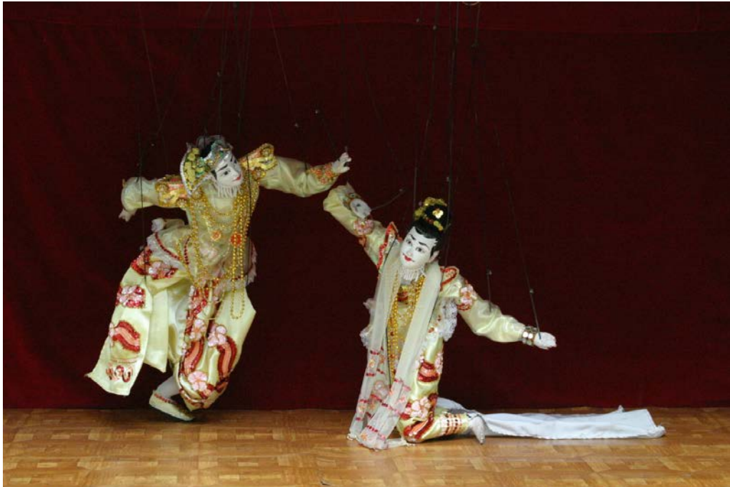
▲ Myanmar Marionette