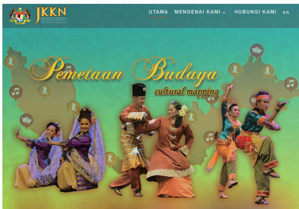
Figure 1 The Homepage of National Department for Culture and Arts' Cultural Mapping Portal

The National Department for Culture and Arts ( Jabatan Kebudayaan dan Kesenian Negara, JKKN ) established the Cultural Mapping portal 10 focusing on three main branches of performing arts: dance, music and (traditional) theatre. The portal contains information of performing arts and practitioners according to the state and district.